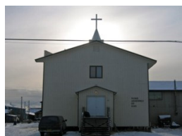
Nome, River of Life Assembly of God

Praise God. All the necessary funding is in place to purchase equipment for 2 locations. This next quarter we will be working diligently to get these locations up and running.