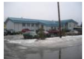
Anchorage, Native Assembly of God